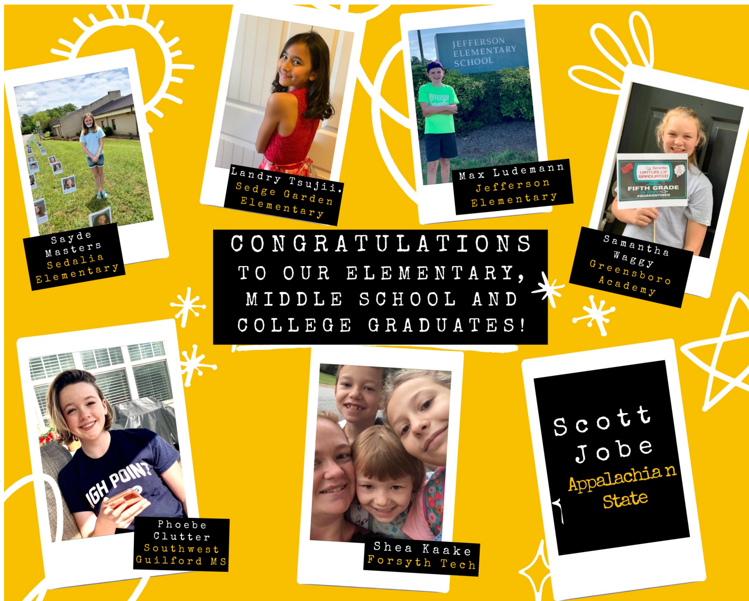
Sayde Masters Sedalia Elementary